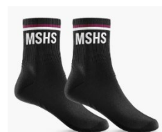
Training Crew Socks