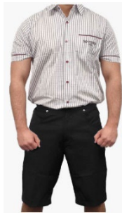
Junior School Uniform