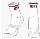
Marsden Crew Socks

It is a requirement of our school site that all students wear covered shoes for health and safety reasons. In particular, activities in Industrial Technology, Food and Design and Science require impervious shoes (i.e. leather formal or sports style shoe) as these provide the best protection for your child's safety. Therefore, we have chosen to apply this standard to all students in all classes (except during sports).