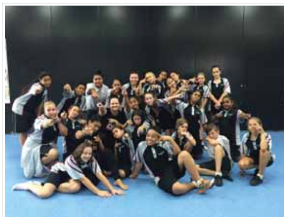
Our Year 7 teachers

Over the last two weeks, Dance students in year 7, 8 and 12 have taken part in various cultural dance workshops from a range of different cultures. We were fortunate enough to welcome two wonderful cultural dance companies, Heilani (Polynesian Dance) and Dance Masala (Bollywood Dance) to inspire and challenge our students to improve their dance abilities as well as gain an insight into the many different cultures we are fortunate enough to be surrounded by in Australia.